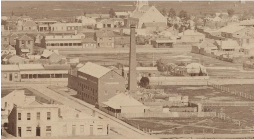
Adelaide Steam Flour Mill 1870 Duryea-1 - View of Adelaide looking south [B 16004/6]