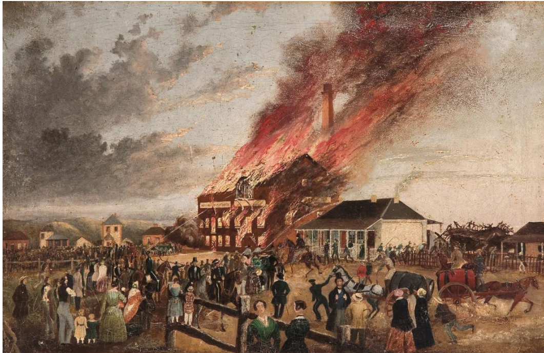
Art Gallery of South Australia - James Shaw, Fire at the Adelaide Steam Flour Mill, Mill Street Adelaide 17 Apr 1855

measures taken that the military were almost instantaneously ready to co-operate with the Police and the civilians. The causes of alarm eventually subsided, but it is understood that some cases containing merchandise of a combustible nature have been voluntarily left in charge of the Police with a view to deliberate examination and report. The Police engine was allowed to remain near the premises, and the representatives of the several Fire Insurance Offices have used every possible precaution, but we believe there is no immediate apprehension of danger as affecting the premises.